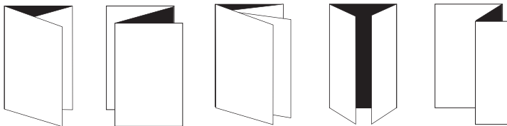
Letter Fold Z-Fold Double Parallel Fold Gate Fold Engineering Fold