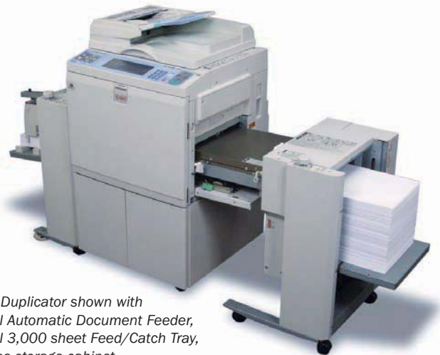
SD460 Duplicator shown with optional Automatic Document Feeder, optional 3,000 sheet Feed/Catch Tray, and base storage cabinet.