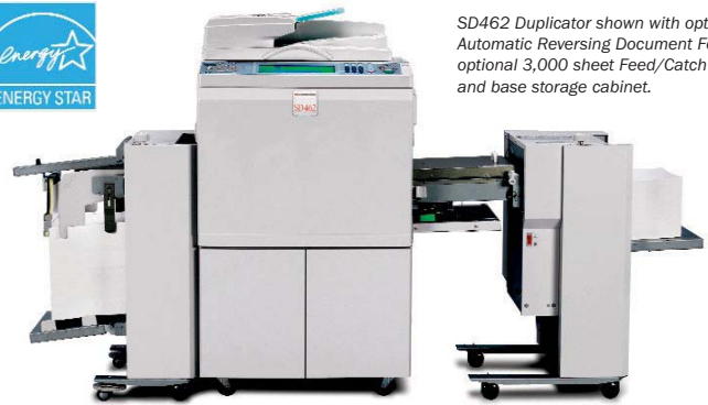
SD462 Duplicator shown with optional Automatic Reversing Document Feeder, optional 3,000 sheet Feed/Catch Tray, and base storage cabinet.