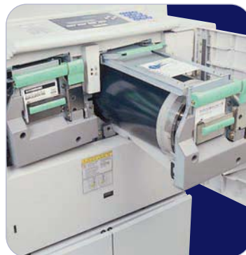
Two-Colors in One Pass

Specifications subject to change without notice. *Color drums sold separately